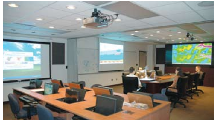
The Laboratory of Excellence for Realtime Computing and Multiscale Modeling is a state-of-the-art facility that will aid in investigating new ways to understand complex groundwater systems across multiple scales.