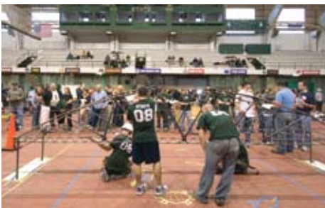
The MSU steel bridge team assembles their bridge for the regional competition.