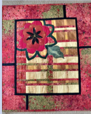
RED FLOWER JAPANESE LADY