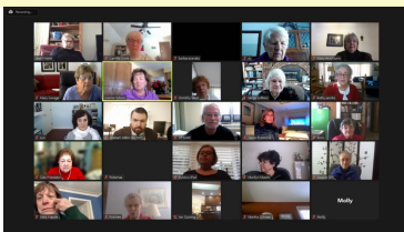
40 members and guests joined the Zoom.

https://us02web.zoom.us/rec/share/vLC8m_epDGZ3mxJrLHkqMi_CMHhJ5Y61Kfb2sPwmNkcDc5GSiszwfT6bU8vAG9X-.Hq0MH1dgo_zsZLO8?startTime=1645207211000