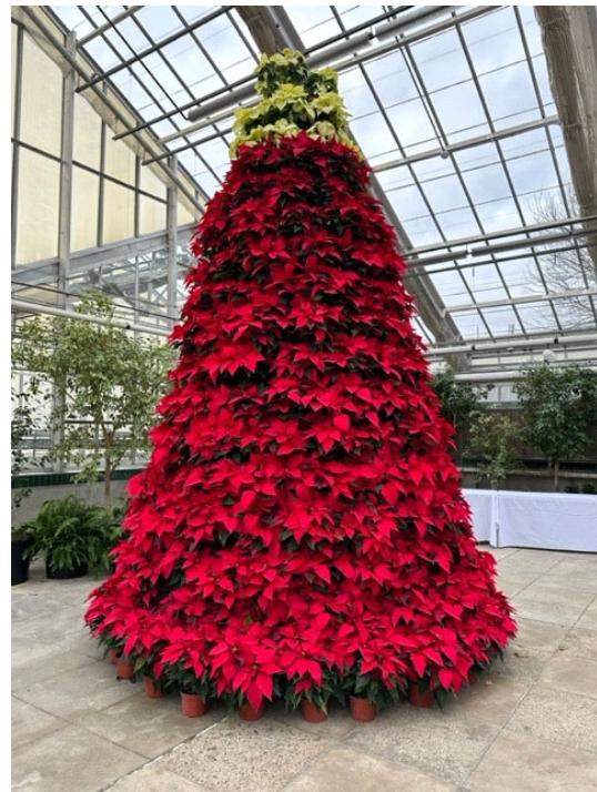
The poinsettia tree frame holds 350 plants, and there are 50 more arranged around it on the floor.