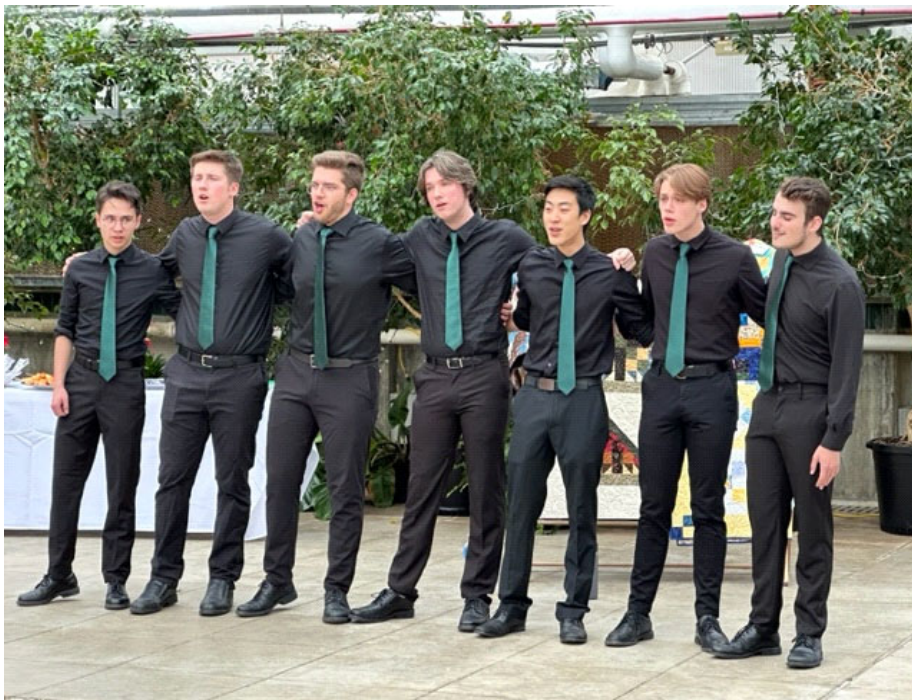
The Spartan Dischords closed their performance with "MSU Shadows" and the fight song.