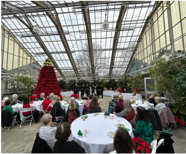
Overview of the event, during the Spartan Dischords' performance.