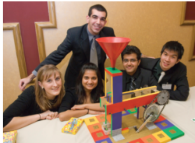
ME 371 design project