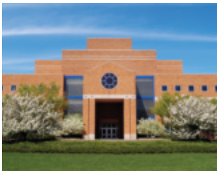
College of Engineering building

mechanical engineering and what it takes to be an engineer in the real world. This experience within the design/build/test atmosphere culminates in a capstone design course. Students in this course utilize all the skills taught in the mechanical engineering