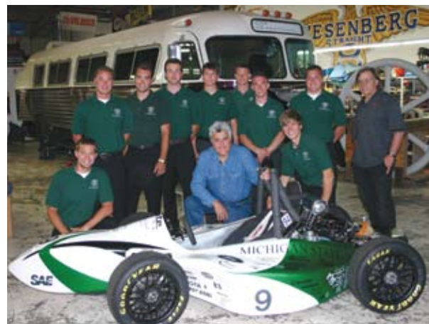
The 2007 Formula SAE Team with Jay Leno.

Details about the race and the team's appearance with Jay Leno can be found at www.egr.msu.edu/fsae . 🌟