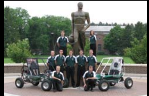
The 2007 MSU Baja Race Team.

The Baja Team also successfully competed with two cars in all three 2007 North American off-road events held by SAE last spring. During the competition at the Rochester Institute of Technology in Rochester, New York, the MSU car flipped, resulting in a cracked roll cage. However, the team pulled together. Within four hours the car was repaired, the safety inspection was completed, and the team was ready for competition.