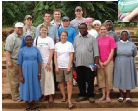
Left: Solar oven team at the mission in Masasi, Tanzania.