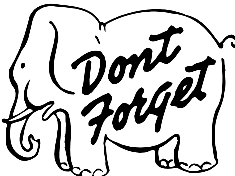
CED Needs YOU!!!!

Whether you are a new professional to cooperative education or a seasoned veteran, CED NEEDS YOU. GET INVOLVED. The organization needs your energy, input and creativ-