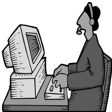
An active, informative LISTSERVE