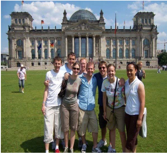
Germany - Engineering in Kaiserslautern, This program welcomes junior and senior electrical & computer engineering students. Past students have enrolled in the following courses: Measurements, Power Systems, Electromagnets , ECE research and Intro to German Language. (see coordinator for details).