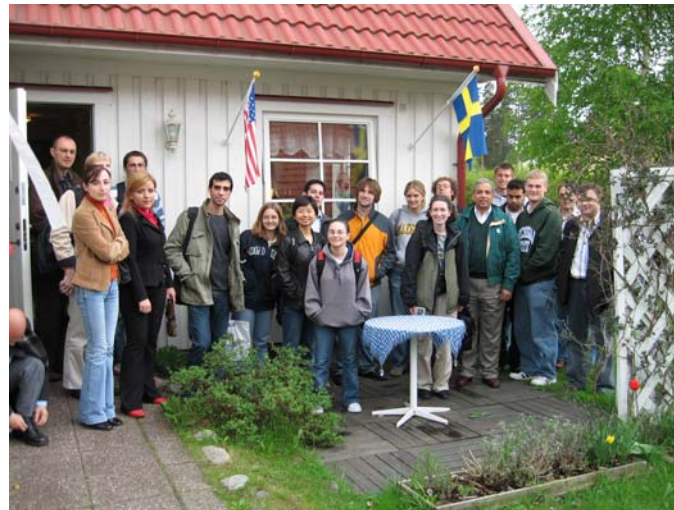
Sweden-Denmark - renewable bio-energy systems /four week summer program aligned with a biennial global conference in Europe/most majors may participate.