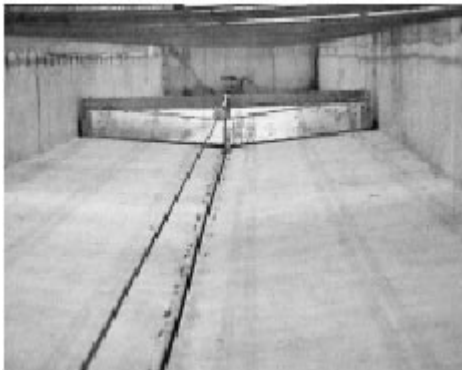
Figure 1. In the MSU manure handling system, a conventional dairy scraper collects feces and transports the material outside the building to be taken to a compost facility.

When manure is distributed to meet a plant's N needs, excess P is applied because the manure N to P ratio is less than the ratio used by the plant. Also, most manure handling systems are not designed to conserve N. Because P is conserved, the N to P ratio decreases. This imbalance increases for manure as applied.