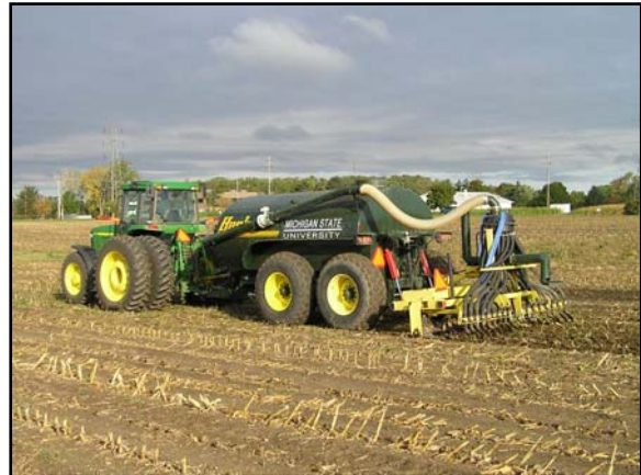
Figure 1. Excellent wheat and cereal rye cover crops were obtained by combining low-disturbance aeration tillage, seeding and slurry application in one efficient operation.

Cover crops have not been used widely in livestock-based cropping systems because establishment costs, competition for labor and added management needs have discouraged their use. Interest in the use of cover crops is increasing because cover crops are effective barriers to overland flow, sedimentation, and manure contamination of waterways. Ongoing work at Michigan State University funded by the Great Lakes Basin Program for Soil Erosion and Sediment Control has shown that excellent stands of wheat and cereal rye can be achieved in untilled corn silage ground by a new process that combines seeding, manure application and aeration tillage in one efficient operation (Fig. 1). The Basin Program is coordinated by the Great Lakes Commission in partnership with the USDA-NRCS , US-EPA , and the Army Corps of Engineers . A specific objective of the work is to evaluate the new process--slurry-enriched micro-site seeding--which combines low-disturbance aeration tillage, seeding, and slurry application in a sustainable and cost effective manner with little soil disturbance or loss of protective crop residues.