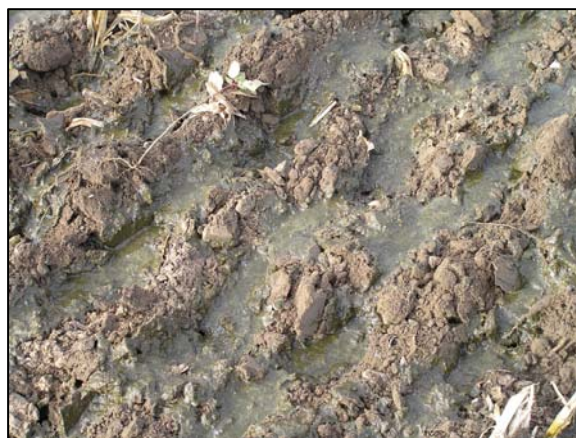
Figure 2. Soil surface after slurry seeding. Seed-laden slurry filled the cracks and fissures created by the aeration tines. Aeration tillage improved infiltration and reduced overland flow.

Vegetative filters, buffer strips and grass waterways have long been used to separate cropped or manure-applied land from nearby waterways. Cover crops are grown specifically to protect the soil from wind and water erosion, recycle nutrients, and improve soil structure and fertility. When manure is applied to a bare soil surface, near-surface filtration and accumulation increase the chance of nutrient and bacterial transport in runoff water. When manure is applied to a vegetative surface, the near-surface zone of high biomass and organic matter enhance adsorption, straining and filtering of bacteria and nutrients.