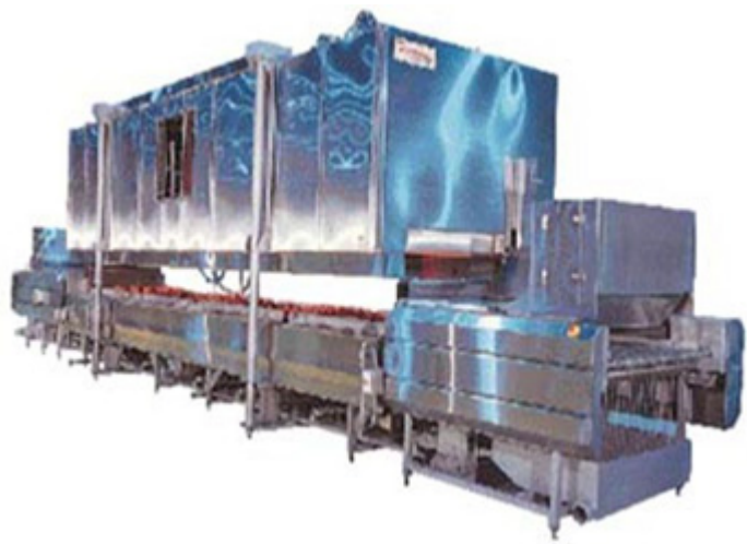
Figure 1. JSO-IV Jet Stream Oven (Stein DSI, FMC FoodTech, Sandusky, Ohio).

In the case of food processing and manufacturing, an important optimization challenge is finding processing conditions that simultaneously ensure safety, meet quality criteria, and maximize the processing yield (and therefore economic returns). It is difficult/impossible to find these best conditions solely by experience when operating commercial ovens in food manufacturing systems (Figure 1), because there are multiple control variables (e.g., temperature, humidity, impingement velocity, and cooking duration) affecting the outcome. In addition, many food processing operations, such as cooking meat patties, are very complex phenomena to express analytically. Therefore, it is not surprising that most studies of optimization have been devoted to relatively simple problems that have just one or two control variables (e.g., retorts for canned foods).